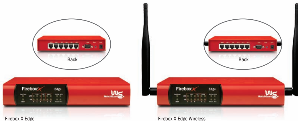
Firebox X Edge