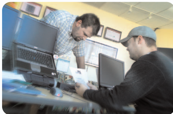
The LiveSecurity team targets a 4-hour response time